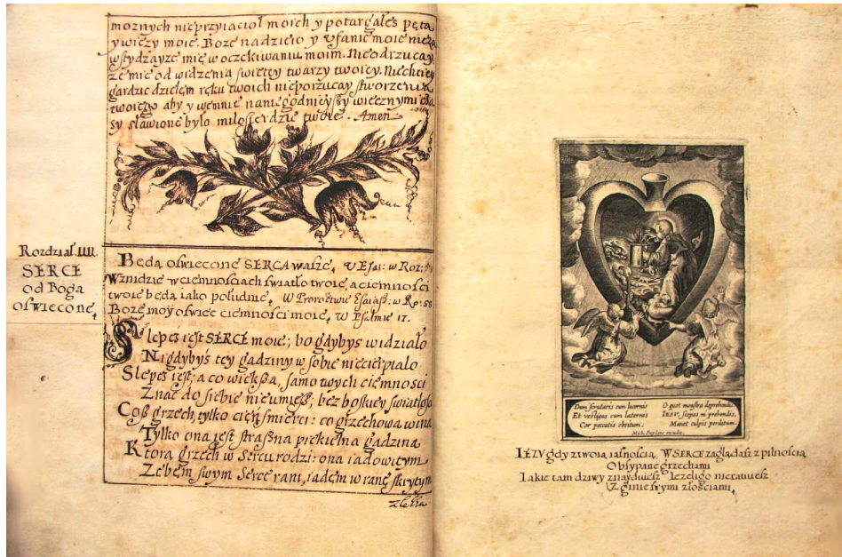
Fig. 3 Manuscript from the monastery of the Norbertine Sisters in Imbramowice, no pressmark.

The author subsequently enforces the brief poem's message with biblical authority, adding no less than three verses asking for the illumination of the heart's darkness (Sirach 2:10b; Isaiah 58:10b; Psalms 17(18):29a). The biblical citations are followed by the poetical text, the 48 lines of which describe the horrible vices dwelling in the sinner's heart. The lyrical explanation of the engraving ends with a request (p. [36]: v. 45-48):