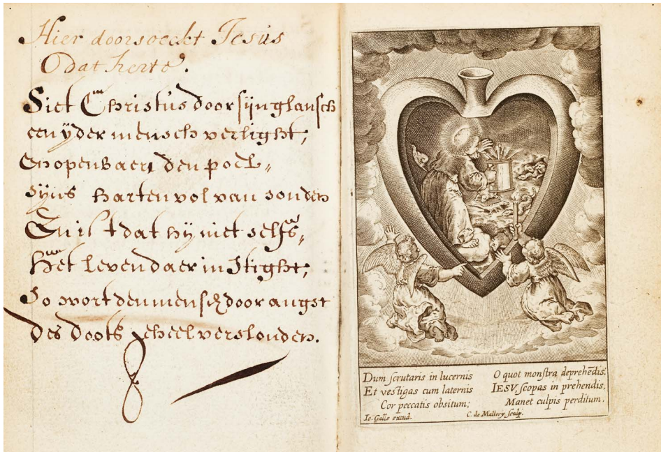
Fig. 1. Het herte Jesu . Manuscript from the Theology Collection, Tilburg University Library, TFK HS 17.

the printed translations, which may indicate the use of other sources, or perhaps that the owner himself composed them. Why some poems differ, and where the unknown texts come from, is unclear, 12 but it does suggest that the owner of the manuscript was picky, and was not easily pleased with the verses he collected and transcribed. 13 The poem which follows our exemplary engraving is thus similar to, though not entirely the same as, a text found on p. 40 of the 1686 Netherlandish translation of Hoburg's Lebendige Hertzens-Theologie . The handwritten verses there read (p. [17]):