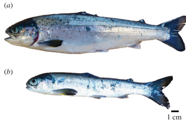
Figure 1. Representative pictures of healthy (a) and GS (b) fish from an aquaculture farm in the Langenuen Strait, Western Norway.