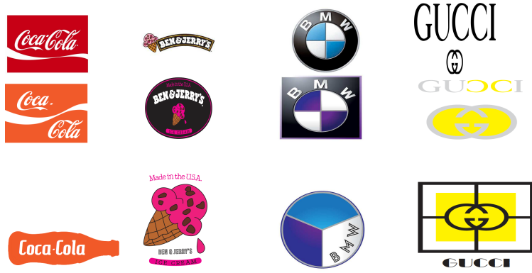
Figure 2: Logo change (original, small, substantial) across brands