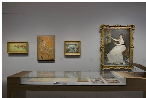
Fig. 6, Installation view of the last space in the exhibition Paul Durand-Ruel. Le pari de l'impressionisme at the Musée du Luxembourg. [larger image]