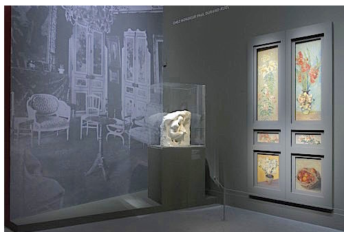
Fig. 2, Installation view of the first space in the exhibition Paul Durand-Ruel. Le pari de l'impressionisme at the Musée du Luxembourg. [larger image]