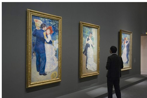
Fig. 7, Installation view of the last space in the exhibition Paul Durand-Ruel. Le pari de l'impressionisme at the Musée du Luxembourg. [larger image]

For most of the public, the main attraction of the Durand-Ruel show was probably that it provided an excellent opportunity to see a large number of high quality works by the impressionists and their circle, which is indeed a merit in itself. The organizers may have been aiming, at least in part, for an impressionist blockbuster show, and this ambition may have informed their choice to focus solely on Durand-Ruel's dealings with the impressionists and the so-called "school of 1830". The title of the exhibition, "Paul Durand-Ruel. Le pari de l'impressionisme" [Paul Durand-Ruel, The Gamble of Impressionism], in any event certainly emphasizes the attention paid to impressionism, and the leaflet that accompanied the exhibition in Paris added another subtitle to it: "Manet, Monet, Renoir..." presumably to make sure that no one would miss the point (fig. 8).