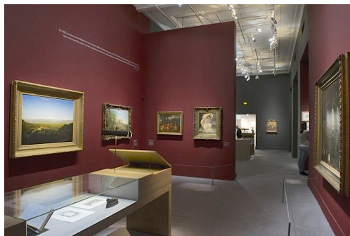
Fig. 3, Installation view of the second space in the exhibition Paul Durand-Ruel. Le pari de l'impressionisme at the Musée du Luxembourg. [larger image]

The next four rooms were, indeed, devoted to the exhibition's central theme: Durand-Ruel's efforts for, and transactions with, the impressionists and their circle. The third room related his first encounters with some of the impressionists in 1870–71 while in London and with Edouard Manet, when he bought a group of twenty-one paintings from him in 1872 (fig. 4). There was also a partial facsimile of Durand-Ruel's stock-books, which the visitor could leaf through in order to discover for him- or herself some of the dealer's major purchases from these artists. The fourth space in the exhibition dealt with Durand-Ruel's role in the impressionist exhibitions of the 1870s, especially the 1876 show organized in his gallery, and brought together a group of works on view at that occasion. The fifth space further pursued the theme of exhibitions and focused on the solo shows organized by Durand-Ruel for some of the artists in his stable (fig. 5). On view were paintings that were part of these exhibitions and some of the exhibition catalogues published by Durand-Ruel for the occasion. The last space, finally, was devoted to the international consecration of the impressionists, brought about by Durand-Ruel's shrewd business tactics in New York, Berlin, Paris, and London (figs. 6, 7). It thus celebrated the final "apothéose de l'impressionisme" [apotheosis of impressionism], the effects of which can still be seen in the present, as this exhibition itself neatly illustrates.