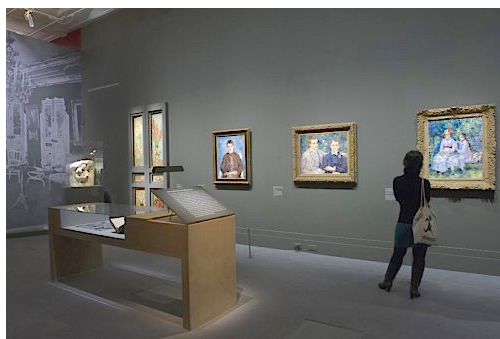
Fig. 1, Installation view of the first space in the exhibition Paul Durand-Ruel. Le pari de l'impressionisme at the Musée du Luxembourg. [larger image]