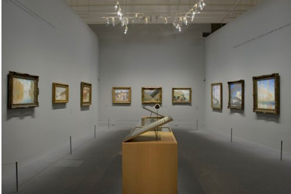
Fig. 5, Installation view of the fifth space in the exhibition Paul Durand-Ruel. Le pari de l'impressionisme at the Musée du Luxembourg. [return to text]