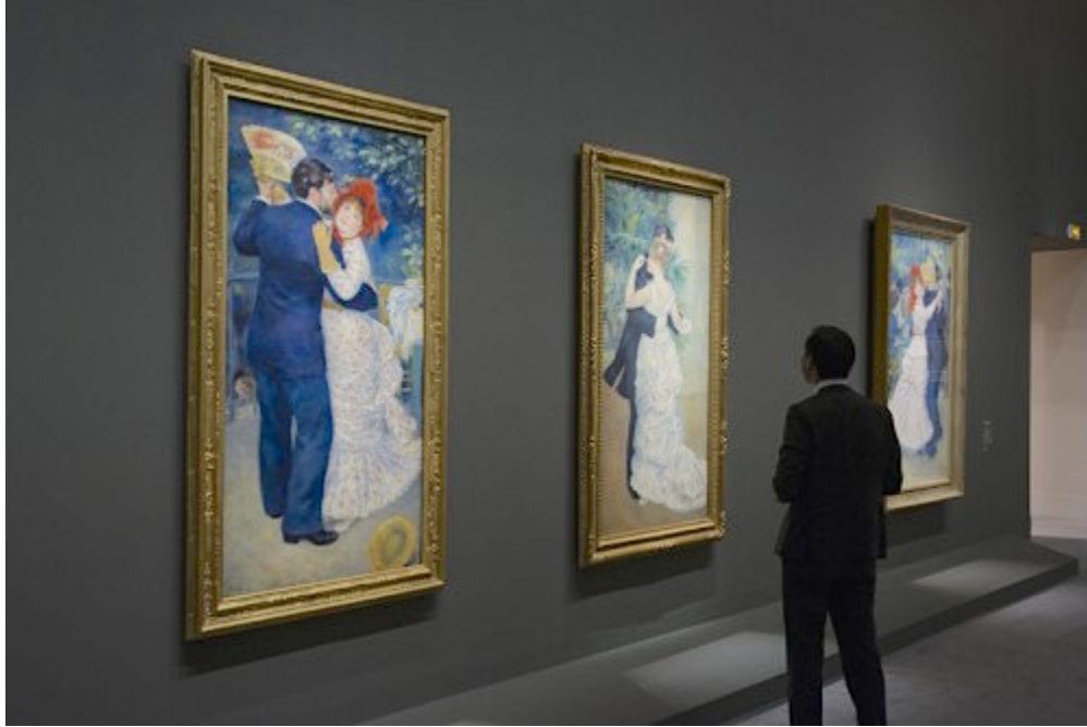
Fig. 7, Installation view of the last space in the exhibition Paul Durand-Ruel. Le pari de l'impressionisme at the Musée du Luxembourg. [return to text]