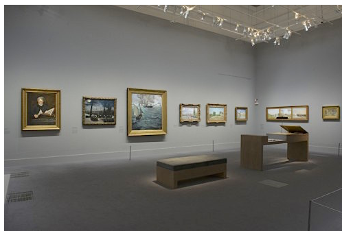
Fig. 4, Installation view of the third space in the exhibition Paul Durand-Ruel. Le pari de l'impressionisme at the Musée du Luxembourg. [larger image]

The next four rooms were, indeed, devoted to the exhibition's central theme: Durand-Ruel's efforts for, and transactions with, the impressionists and their circle. The third room related his first encounters with some of the impressionists in 1870–71 while in London and with Edouard Manet, when he bought a group of twenty-one paintings from him in 1872 (fig. 4). There was also a partial facsimile of Durand-Ruel's stock-books, which the visitor could leaf through in order to discover for him- or herself some of the dealer's major purchases from these artists. The fourth space in the exhibition dealt with Durand-Ruel's role in the impressionist exhibitions of the 1870s, especially the 1876 show organized in his gallery, and brought together a group of works on view at that occasion. The fifth space further pursued the theme of exhibitions and focused on the solo shows organized by Durand-Ruel for some of the artists in his stable (fig. 5). On view were paintings that were part of these exhibitions and some of the exhibition catalogues published by Durand-Ruel for the occasion. The last space, finally, was devoted to the international consecration of the impressionists, brought about by Durand-Ruel's shrewd business tactics in New York, Berlin, Paris, and London (figs. 6, 7). It thus celebrated the final "apothéose de l'impressionisme" [apotheosis of impressionism], the effects of which can still be seen in the present, as this exhibition itself neatly illustrates.