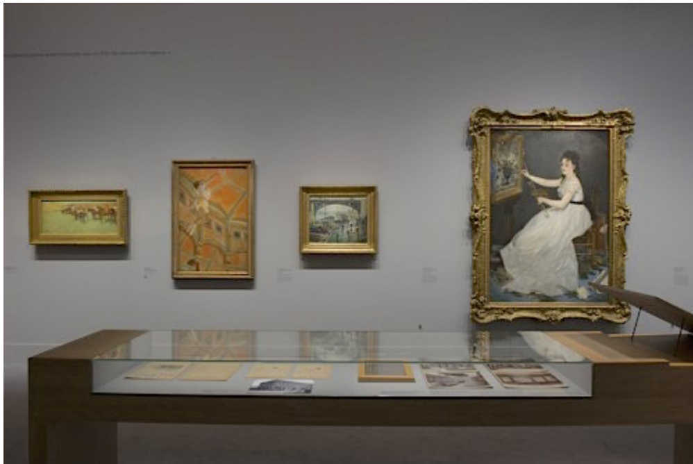
Fig. 6, Installation view of the last space in the exhibition Paul Durand-Ruel. Le pari de l'impressionisme at the Musée du Luxembourg. [return to text]