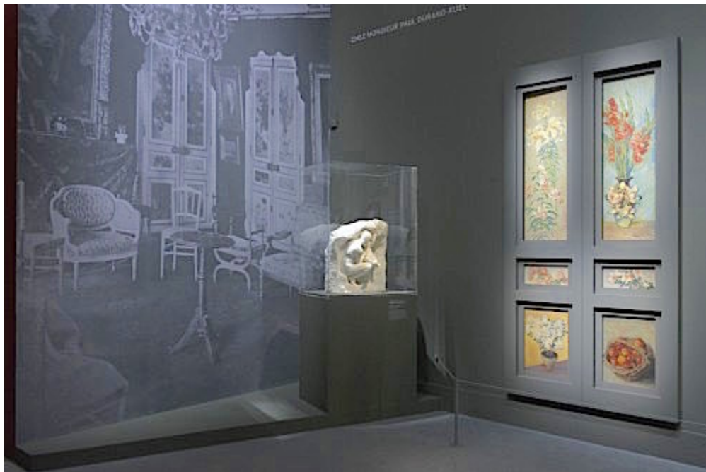
Fig. 2, Installation view of the first space in the exhibition Paul Durand-Ruel. Le pari de l'impressionisme at the Musée du Luxembourg. [return to text]