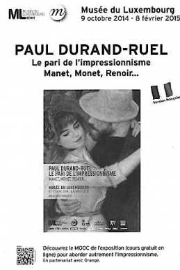
Fig. 8, Leaflet Paul Durand-Ruel. Le pari de l'impressionisme. Manet, Monet, Renoir... [larger image]

It comes, then, not as such a big surprise that Durand-Ruel himself was not as prominently present in the exhibition as one would expect. Although the first room focused on Durand-Ruel and his family life, the photographs, publications, letters, and other writings that referred to the dealer were clearly secondary to the impressive line-up of impressionist and other masterworks on the walls around them in the other exhibition spaces.