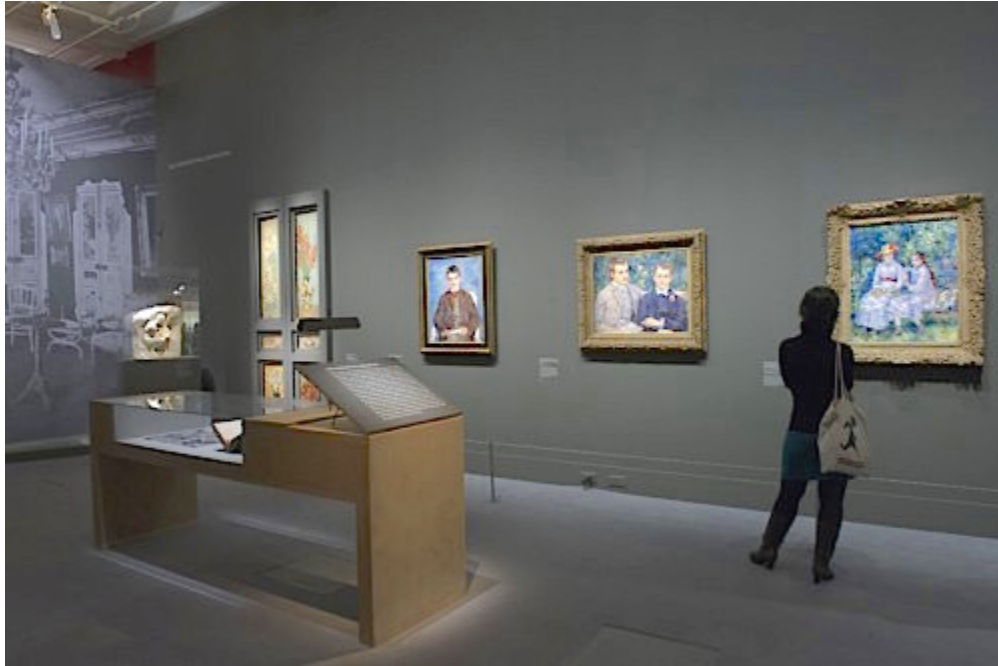
Fig. 1, Installation view of the first space in the exhibition Paul Durand-Ruel. Le pari de l'impressionisme at the Musée du Luxembourg. [return to text]

All photographs courtesy of Didier Plowy for RMN-Grand Palais, Paris 2014, unless otherwise noted.