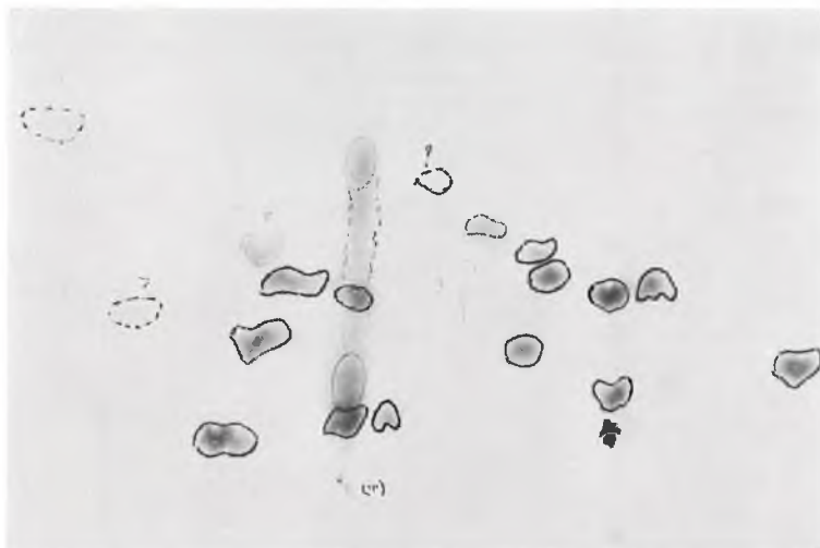
FIGURE 1. Peptide map of the tryptic digest of polypeptide chain A-1 (for experimental condi- tions, see text).