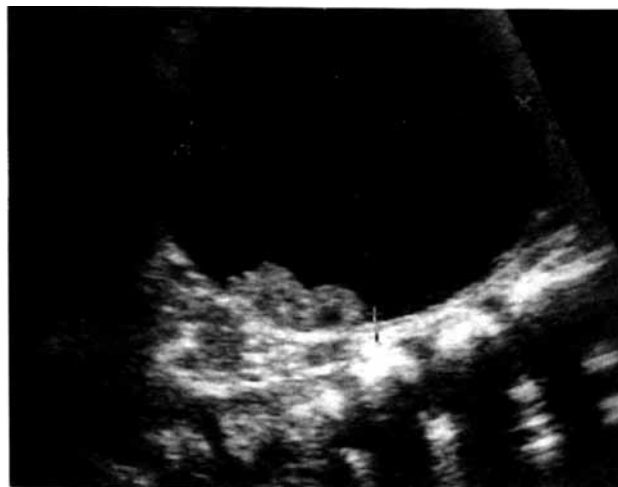
FIG. 1. Preoperatively ultrasound shows cystic abdominal lesion mistakenly diagnosed as mesenteric cyst.

* Requests for reprints: Department of Urology, University Hospital, P. O. Box 9101, 6500 HB Nijmegen, The Netherlands.