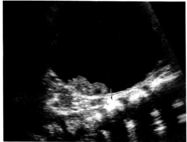
FIG. 1. Preoperatively ultrasound shows cystic abdominal lesion mistakenly diagnosed as mesenteric cyst.

* Requests for reprints: Department of Urology, University Hospital, P. O. Box 9101, 6500 HB Nijmegen, The Netherlands.