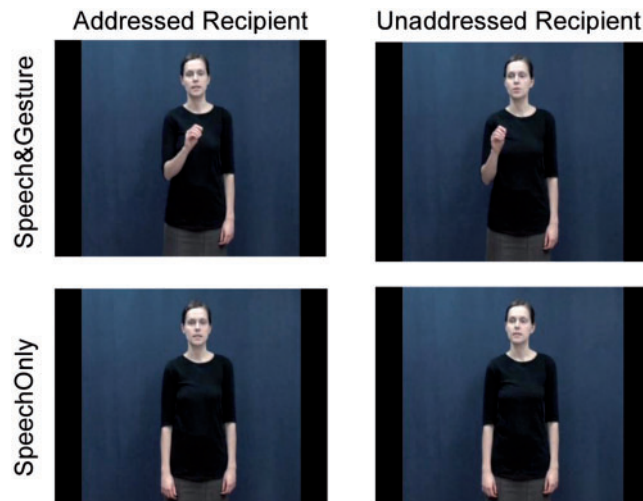
Fig. 2 Example of stills from the four types of video stimuli used.

One of our aims was to avoid confounding the visual angle of the gestures in the addressed and unaddressed conditions with recipient status signaled through eye gaze direction. Thus, rather than showing the same gestures recorded from a lateral and a frontal visual angle, the confederate speaker repeated each stimulus sentence, including the