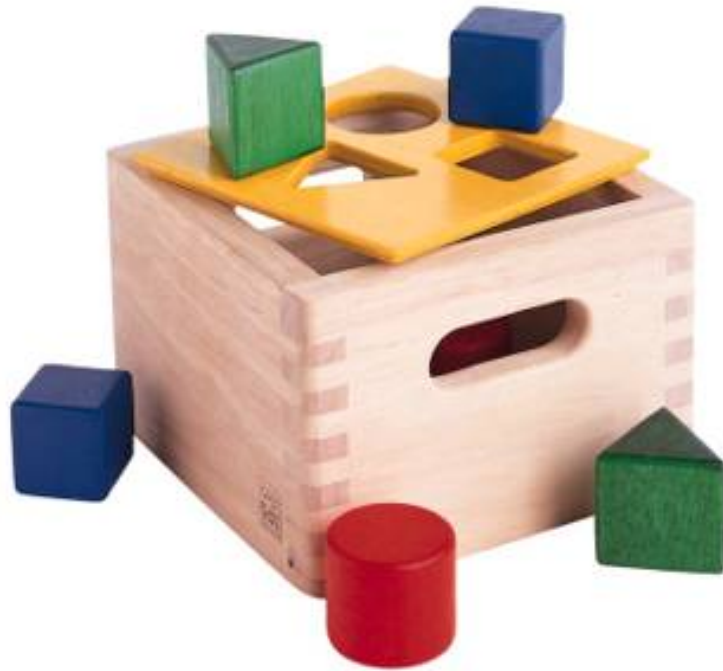
Figure 2.2: Box and blocks analogy from childhood memory: the holes on one end correspond to input templates, the holes on the other end correspond to output templates. Imagine blocks going in through one and out through the other. The blocks themselves correspond to input or output files with attached metadata . Profiles describe how one or more input blocks are transformed into output blocks, which may differ in type and number. Granted, I am stretching the analogy here; your childhood toy did not have this magic feature of course!

value, unassign a value, or copy a value from an input template or from a global parameter. Through these templates, the actual metadata can be constructed. Input templates and output templates always have a label describing their function. Upon input, this provides the means for the user to recognise and select the desired input template, and upon output, it allows the user to easily recognise the type of output file. How all this is specified exactly will be demonstrated in detail later.