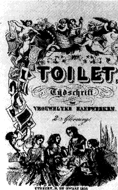
Fig. 3. Title page of Toilet. Tijdschrift voor vrouwelijke handwerken (1848-1854).