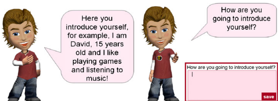
Fig. 2 Example of structuring ( left ) and problematizing ( right ) scaffolds

The conversations within each triad of students were audiotaped with voice-recorders. We coded the transcribed protocols of each lesson. The unit of analysis was the conversation turn of each speaker. Each conversation turn was coded with one main category code, see