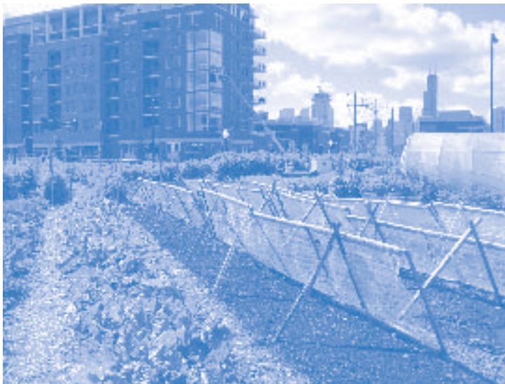
In some cities ‘urban farming’ is used to fill up demolished parts of neighbourhoods

network. This movement of “slow cities” – closely linked to the “slow food” movement that started in Italy in 1986 – aims at improving the quality of life, sustainability and diversity of local communities in our fast-paced, globalized economy. 48 Cittaslow attempts to take advantage of local qualities instead of going with the global flow. Other places have high hopes of the so-called “silver economy”: an ageing population may offer opportunities for the development of new services and applications in the field of living, leisure and care. Shrinking cities in the Ruhr Area, for instance, are experimenting with smart living concepts for elderly people. In this sense, shrinking cities are societal laboratories where new methods are tested that are also useful for growing cities. However, we should not be over-optimistic when it comes to utilizing shrinkage. In any case, the American model of Sun City is not likely to be the future for shrinking and ageing Europe. Examples from Belgium (Messancy) and Finland (Seniorpolis) demonstrate that setting up communities especially for the elderly is not very successful. 49