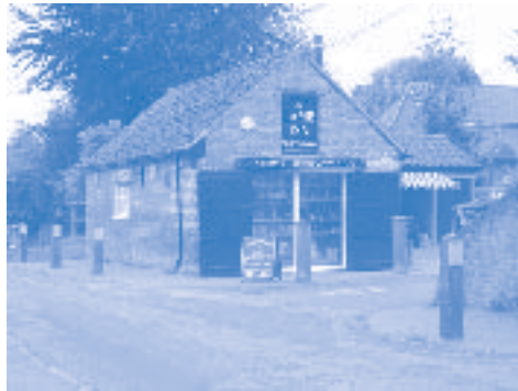
In the United Kingdom there are more than 250 community-owned village shops

In the UK, the shift from public power to local empowerment has been captured in the term “civic economy”, that is “comprising people, ventures and behaviours that fuse innovative ways of doing from the traditionally distinct spheres of civil society, the market and the state”. 63 Ideally, this new form of collective action produces outcomes that neither the state nor the market could have achieved on its own. In this respect, the shrinking city of Ludwigshafen (Germany) is an interesting case. The municipality has triggered the setting up of more than fifty “social events”: groups (students, employees from local firms or members of the Rotary club) are volunteering for one day to help in urban restructuring, varying from painting buildings to renovating the local children’s farm. 64