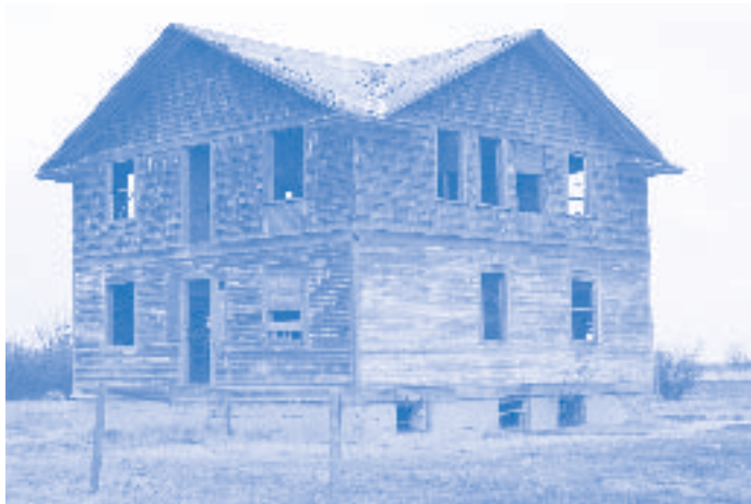
In the United States we can still find some “ghost towns” from the Gold Rush period