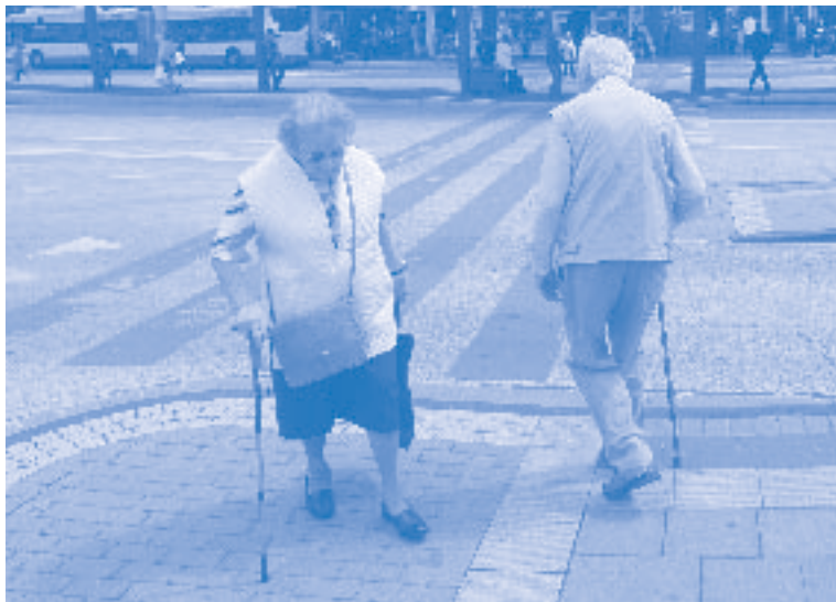
The ageing of society is clearly visible in the street, like here in Solingen