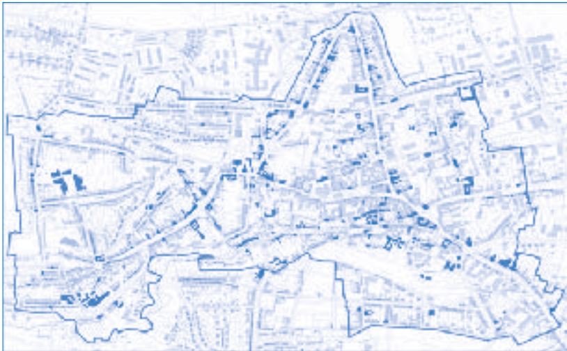
Figure 1 The perforated city: the dark spots indicate shrinkage in the physical environment 19

growing difficulties in maintaining the local infrastructure. Furthermore, the downward spiral of spatial-economic deterioration is likely to be paralleled by problems in the social-cultural domain. Unemployment and degradation of neighbourhoods may lead to social isolation, resentment and tensions in the city. Myrdal called these self-reinforcing developments “backwash effects”. At the same time, he argued that there might be counteracting forces at work. Where localities shrink, other places grow. The territory in trouble might benefit from “spread effects” from growth areas. As time goes by, high wages, high rents and congestion problems in these growth centres could offer new perspectives for the shrinking area and a process of revitalization and re-urbanization could take place. However, Myrdal thought that the backwash effects tend to dominate the spread effects. Looking at empirical studies on urban life cycles, it seems that he was right: as the cases of Manchester and Leipzig show, cities can indeed grow again, but the trajectory of shrinking places is mostly path-dependent. 20