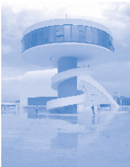
The Spanish city of Avilés hopes to counter shrinkage with flagship projects

aimed at “developing residential attraction in Roubaix for new populations attracted by heritage and cultural amenities”. 36 In turn, the city of Avilés in Asturias (Spain) is attempting to get rid of its old industrial image by investing in flagship projects (the Oscar Niemeyer International Cultural Centre and a knowledge park called “Innovation Island”), accompanied by aggressive place marketing.