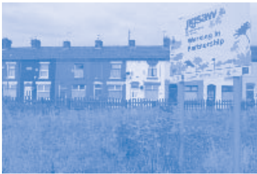
Coping with shrinkage involves the cooperation of many local stakeholders

Urban governance has both a horizontal and a vertical dimension. The horizontal one refers to the diversity of types of actors, groups and institutions involved, whereas the vertical aspect deals with the different administrative scale levels that play a part, from the European to the local. 51 As a transformation process population decline resembles other urban governance issues, such as economic restructuring, social inclusion and sustainability. At the same time, shrinkage has distinct characteristics that pose some real challenges for urban governance.