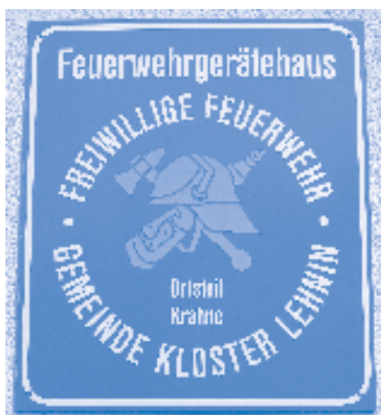
The voluntary fire brigade in German localities is a great example of civic action

Perhaps the best known example of citizen power is the Swiss cantonal system of direct democracy: for centuries, citizens have been able to use their voting right to amend or veto laws, rules and spending bills in the canton they live in. On the urban level, the system of the Brazilian city of Porto Alegre is often highlighted. In 1989, the city council introduced the tool of “participatory budgeting” in an attempt to tackle the city’s huge socio-economic problems. Since then, the residents have been asked every year to identify spending priorities, choose budget delegates and vote for proposals that the city consequently has to carry out. According to the World Bank, this method has certainly improved the quality of life of the local residents. 71 The Porto Alegre model has been copied by a number of cities, towns and villages across the world. In Europe, too, more and more places, from Solingen (Germany) to Sevilla (Spain) and from Örebro (Sweden) to Plock (Poland), are adopting the participatory budgeting method. 72 New media, like the internet and cellphones, are often used to collect and evaluate the plans that citizens propose. In Solingen – a shrinking and nearly bankrupt city – in 2010 the government asked its inhabitants via the internet which spending cuts the municipality should implement. For this innovative approach to citizen participation the city received the “European Public Sector Award 2011”.