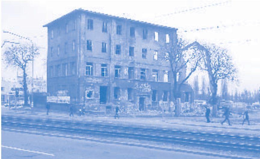
Planning for decline is an euphemism for demolishing buildings, like here in Poznan

instead of pulling it down. 44 Therefore, it is always important to pay attention to the “software” of an area when coping with shrinkage. What socio-demographic features does the area have? What are the needs of the residents? What problems do they encounter in organizing their daily lives? The results of such consultations can reveal useful insights for local policy, e.g. the wish to have better street lighting, safer cycle paths or more green spaces. In the shrinking city of Brno (Czech Republic) such a bottom-up approach has led to a focus on family support. 45 Making the live of local families easier is seen as the main solution to the city’s shrinkage problems. Since 2008, the urban authorities have subsidized what they refer to as “family cohesion” with measures to improve the home-work balance and the social inclusion of child-caring parents. In addition, families can get free advice and support at local contact centres that are part of the so-called “Family Point” project. For shrinking cities creating a child-friendly environment is a wise strategy, because it can be a decisive factor for local families remaining in the neighbourhood and thus prevent the further decline of a local community.