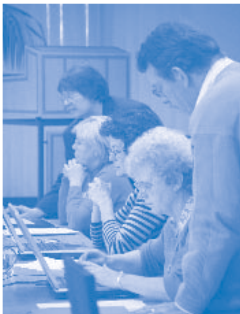
Information technology and an ageing society can go together well