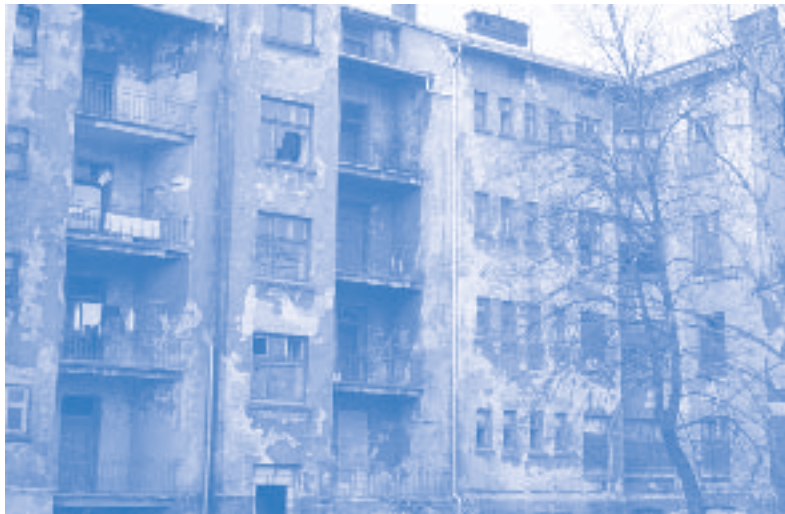
Shrinkage can also lead to socio-spatial polarization in some parts of the city