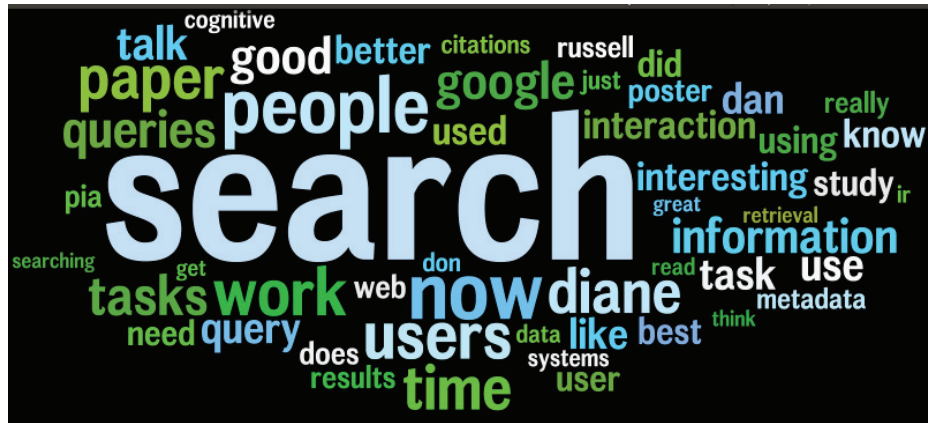
Figure 1: Word cloud of tweets during IiX'12 (both #iix2012 and #eurohcir).

During IiX'12 there was quite some activity in the social media, and in particular on Twitter. We tracked all the messages containing the conference hashtag #iix2012, that mention the user @iix2012, and the messages about the EuroHCIR workshop containing the hashtag #eurohcir. This leads to the following statistics: 1,219 tweets were sent, by 71 distinct users, 574 (47%) of the tweets were retweets, and 167 (14%) of the tweets contain links. The shared links contain mostly pictures of the conference, links to presentations, papers and project home pages.