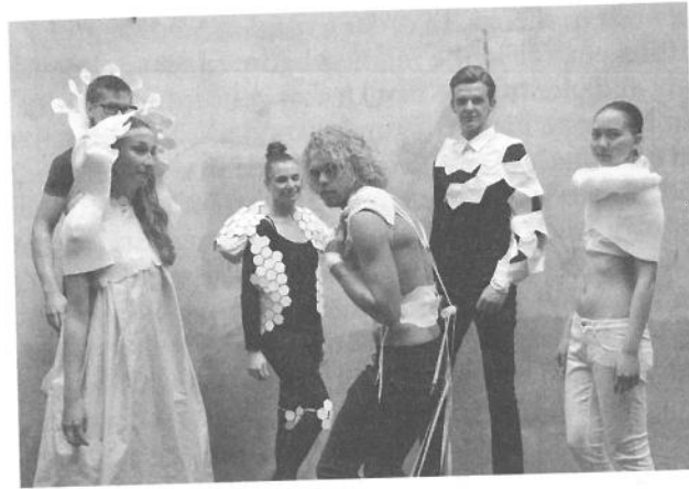
Crafting Wearables, 2013