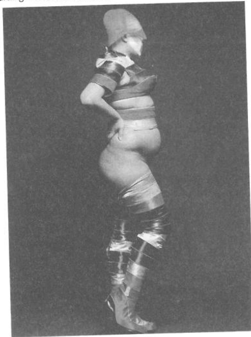
Leigh Bowery, Session III, look 15, augustus 1990

they narrate and perform their selves. In the words of sociologist Zygmunt Bauman, people are 'artists of life'. We are not who we are, but we perform who we are. In this theoretical view, identity is a performance that we shape each and every day again in embodied behaviour. Identity is a process that involves change, minimally or dramatically, but inevitably.