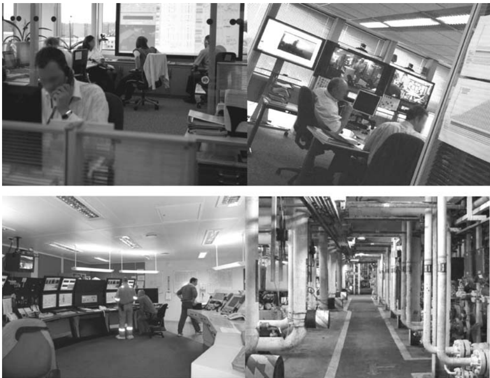
Figure 1. Typical work environments onshore and offshore. Top two pictures: team areas in the onshore office; bottom left: view of the main console in a central control room offshore; bottom right: part of the production area on an oil platform.

The divide in roles and responsibilities was also reflected in the demographics and work patterns of the two groups. Onshore personnel were characterized by a much higher number of university educated engineers and a larger number of younger and female staff, compared to offshore personnel. Onshore personnel further kept normal office hours (eight hours, Monday to Friday), while offshore staff operated on twelve hour day and night shifts for seven days a week. The physical working conditions for onshore and offshore workers are shown in Figure 1, which presents typical environments in the office onshore and on the rig offshore.