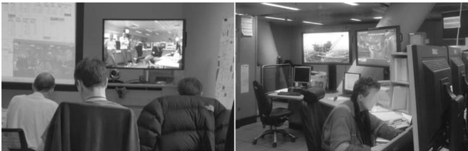
Figure 2. Use of the video-link in the onshore office during a meeting with offshore (left) and video-screens from the central control room into the office (right).

According to Clark and Brennan (1991), capabilities of media can be described with respect to eight characteristics that determine the nature of communication: copresence (group members occupy the same physical location), visibility (group members can see one another), audibility (group members can hear one another), cotemporality (communication is received at the approximate time it is sent),