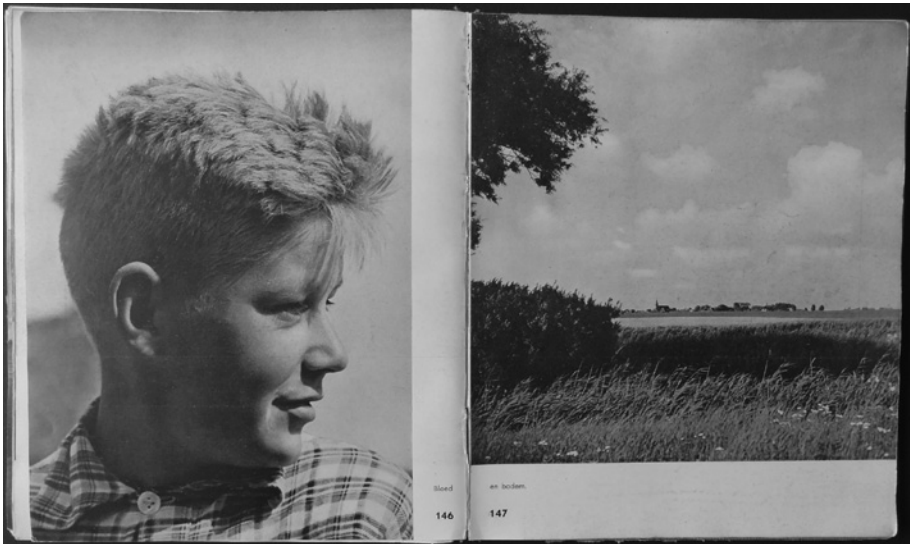
Figure 3. Blood and soil in Friesland–Friezenland ; photography by Van Heemskerck Düker.

German border (Ost Friesland). For exactly the same reasons that folklorists refrained from depicting a Greater Frisian territory, Van Heemkerck Düker chose it for the subject of his Heimat photo book: Its representation implied acceptance of the concept of the Germans and the Dutch united in one single Germanic People.