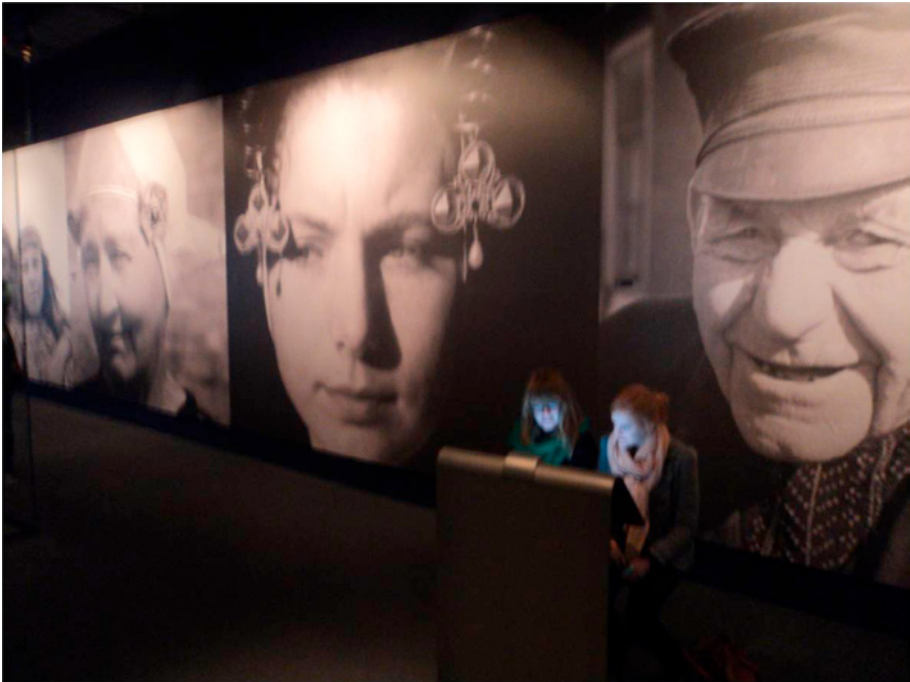
Figure 7. A portrait by Van Heemskerck Düker on a wall panel in the Open-air Museum, Arnhem, 2012; photography by R. Ensel.

Van Heemskerck Düker’s record of faces of an ethnic people and his six thousand pictures of ‘life signs’ demonstrate a fascination with a banal and almost fetishist superficiality. Guided by a ‘rhetoric of presence,’ as Benjamin put it, the body was captured and read for the straightforward message it revealed about the collective body and mind of the nation. Ambivalence and multiple readings were ruled out. 57 Alternative readings should question the