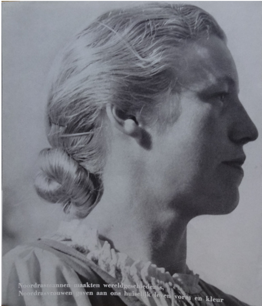
Figure 5. 'Men of the Nordic race made history, women of the Nordic race shaped and added color to our domestic life;' Who knows Germany? Exhibition on 5,000 Years of Völkisch Culture ; photography by Van Heemskerck Düker.

Friesland–Friezenland and Wie kent Germanje , life was no laughing matter in Greater Germany. Models are sometimes dourly staring into a wide-open space. They are durable, experienced, ethnic, and rural. The light turns the face into a marked landscape that can be read. The photography is accompanied by vocabulary borrowed from both scientific racism and esotericism. This yields hallucinatory, and sometimes harsh, images and bombastic texts.