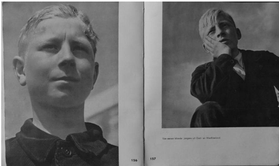
Figure 2. Sturdy youngsters in Friesland–Friezenland : ‘Of one blood. Boys from Friesland and Eastern Friesland;’ photography by Van Heemskerck Düker.

Not all photos were taken by Van Heemskerck Düker himself. De Haas, Erich and Hans Retzlaff, and Herman Heukels also supplied photos. But it was Van Heemskerck Düker who was responsible for the visual editing, and who in this way created a single coherent visual narrative from his own photos and those of other photographers. For instance, for a ‘blood and soil’ text of Friesland–Friezenland (the combination of land and people is already implied in the book title), the instruction ran: ‘Blood and Soil as large as possible and 1/1.’ The portraits of land and people were printed side by side in equal size. The same applied to the East- and West-Frisian boys on pages 156 and 157 (‘Of one blood’). In the instruction, they are linked by a brace ‘as large as possible.’ 39 Here, Van Heemskerck Düker’s specialism in portrait photography came to the fore.