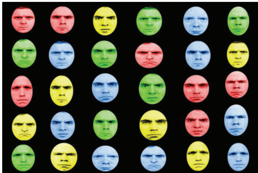
Figure 2. Sample angry male stimuli taken from the facial-emotional Stroop task.

tory, they were seated at a desk in an experimental cubicle, 50 cm away from the computer monitor. Prior to experimental testing, all participants first provided their consent for participation followed by a general screening questionnaire