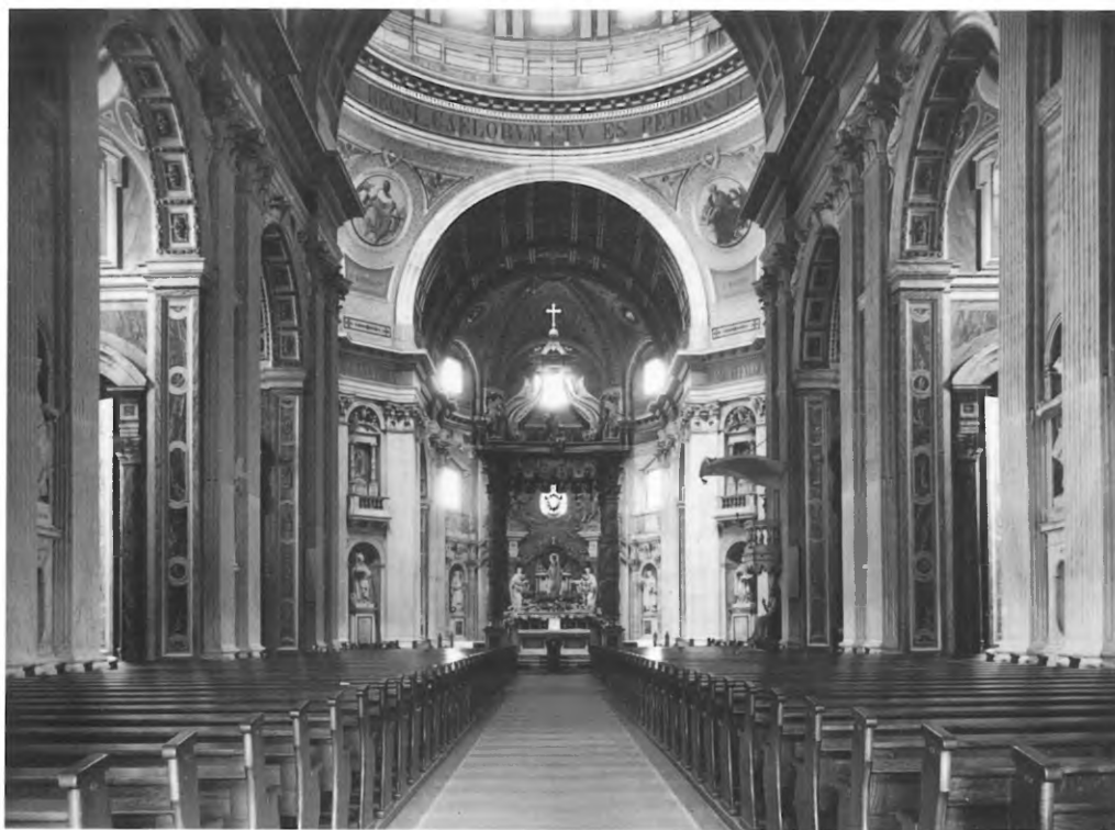
3. Oudenbosch, Basilica of Sts. Agatha and Barbara, interior.