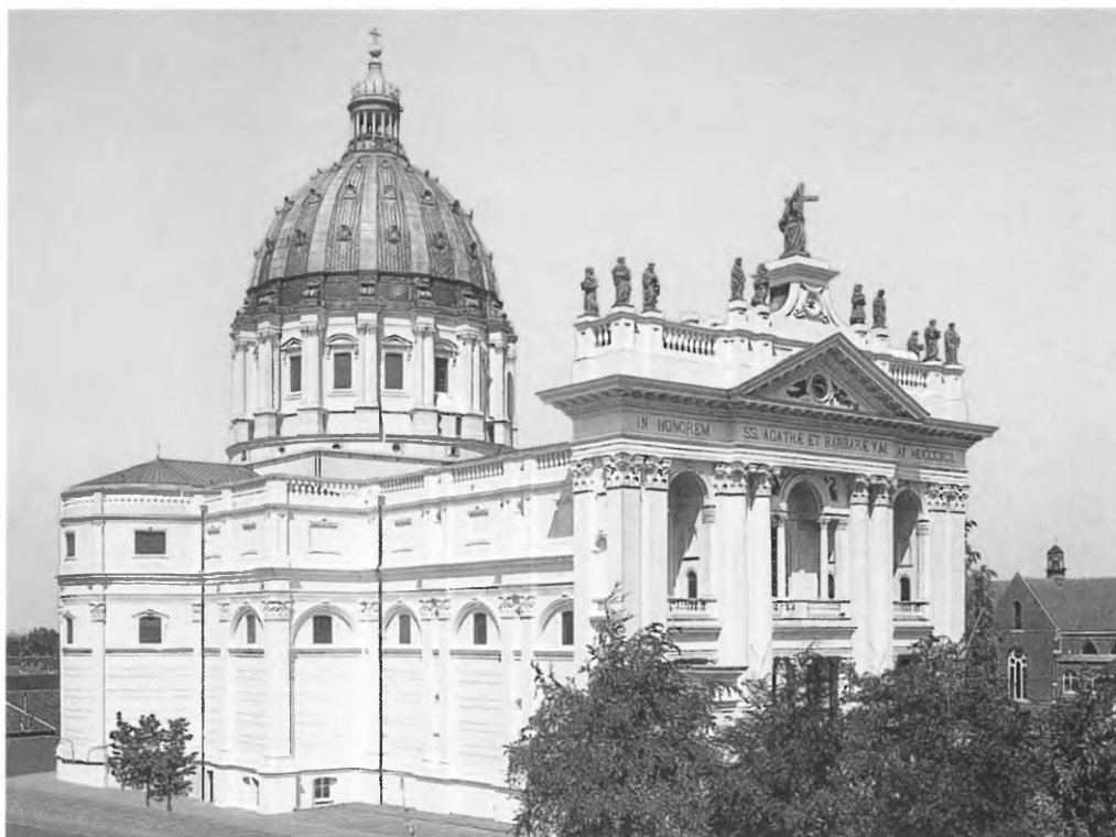
2. Oudenbosch, Basilica of Sts. Agatha and Barbara, exterior from southwest.

What has been carefully underexposed in the Cuypers historiography, is any connection between the trip to Rome and the architect's work in hand. 21 It is only in local publications in western Noord-Brabant that we find any mention of the fact that Cuypers' journey was fund-