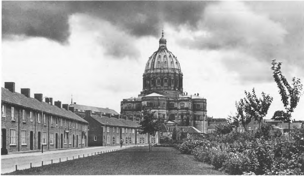
1. Oudenbosch, Basilica of Sts. Agatha and Barbara seen from the north, 1960 ca.

long as contemporary christian art did not link up with the broken line of development of medieval art, little good could come of it. Whether Cuypers ever sought out any of the 'pious Nazarenes' or 'decadent Pre-Raphaelites' is unknown. 9 After all, these must have been the only practising artists in Rome with whom he might have felt any affinity, given both their historical orientation and their aim of reviving the fresco tradition. In earlier contacts with the Vatican, Cuypers had called attention to his efforts to revive the figurative mural in the Netherlands, in combination with the adoption of the Gothic style in architecture, of course. 10