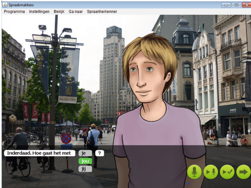
Fig. 18.2 Screenshot of a morphology exercise in the DISCO system. The student gave the correct answer which is indicated by the green block . The functions of the four buttons on the right of the screen are (from left to right): start and stop recording speech input, listen to your own answer, listen to the prerecorded correct answer and proceed to the next prompt