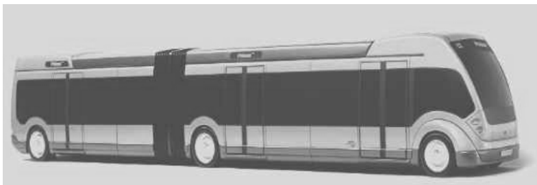
Figure 2: Phileas bus in Eindhoven, the Netherlands

The Phileas project is situated in the urban region of Eindhoven, in the south-eastern part of The Netherlands. In the early nineties, the municipality expressed the ambition to create a real innovative concept for urban public transport. An important motive was the deteriorating economic circumstances in this region, in particular in the sector of automotive and electronics industries. Using substantial amounts of subsidies from the Ministry of Economic Affairs, a project was started to develop a new concept for an extended bus, using semi-automated driving facilities, clean propulsion technology (electricity) and a very low noise emission level. Because of the option for automated driving, the construction of a dedicated bus lane was considered necessary. The concept is called Phileas. The operational phase of the first part of the network is expected to start in April 2004. It concerns a route of about 15 km. linking Eindhoven airport with the main intercity rail station and the main economic and shopping city centre in the region. Somewhat later, as soon as the construction of the infrastructure has been finished, a link to a suburban town will be taken into operations. In the future, extension of the network is expected to the northern suburban villages. Figure 2 gives an impression of the high-tech bus.