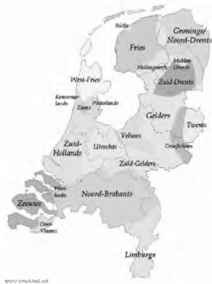
Figure 1. Dialect distribution in the Netherlands